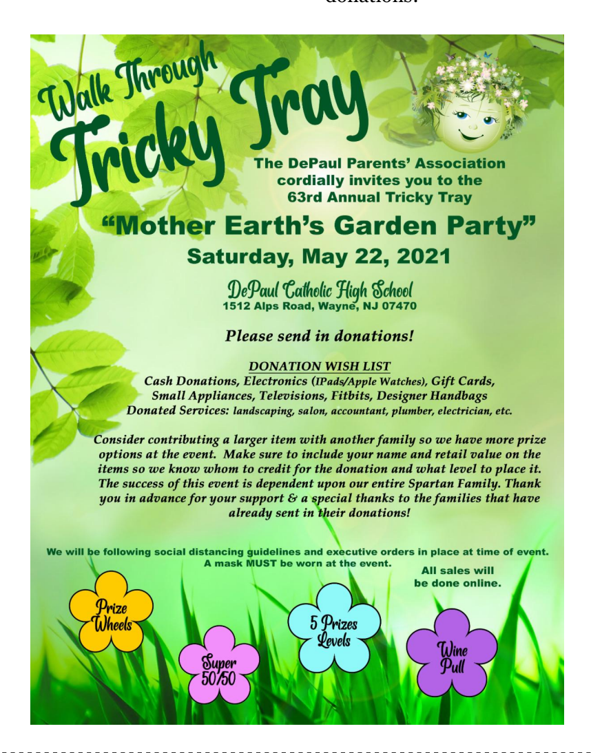
Tricky Tray Prep! Committee Members Working Hard!

know whom to credit for the donation and what level to place it. The success of this event is dependent upon our entire Spartan Family. Thank you in advance for your support & a special thanks to the families that have already sent in their donations!